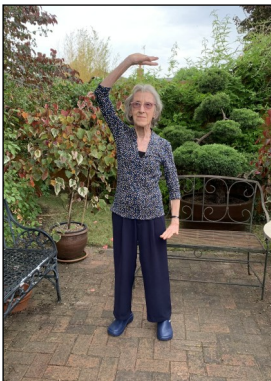
Stretching the spine in warm ups

All classes held in Ruddington Village Hall every Thursday.