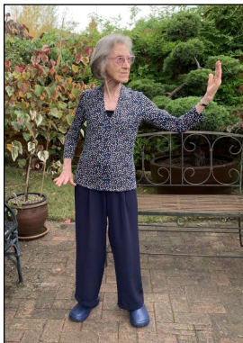
Neck movement in warm ups