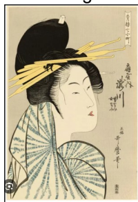
No special clothing