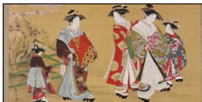
Groups at tai chi