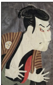
Sun style hands