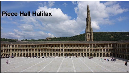
Piece Hall Halifax

Interestingly, UK destinations were well represented with perhaps unexpected recommendations. Bradford, currently the 2025 city of culture, Halifax with the Piece Hall and West Yorkshire in general had provided a number of interesting visits. Liverpool's links with